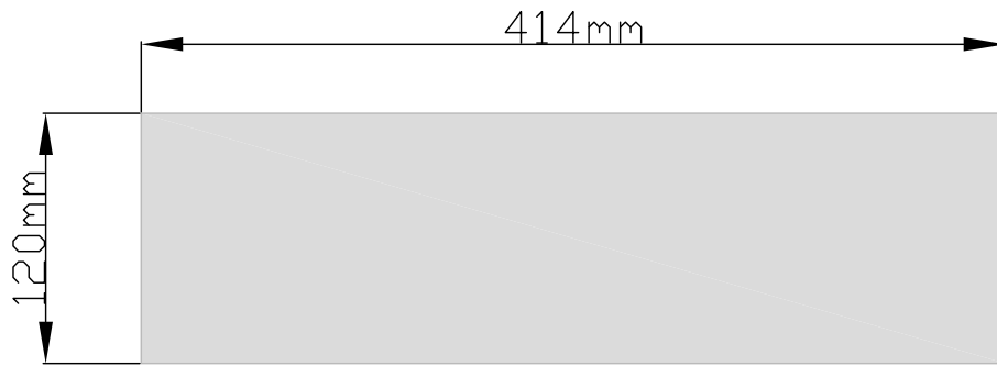
Recommended opening size